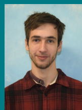
Mr Blechynden Technologies