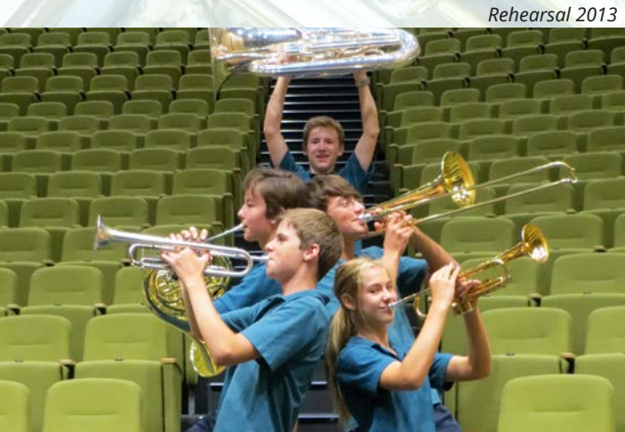
50th Anniversary Concert 2022