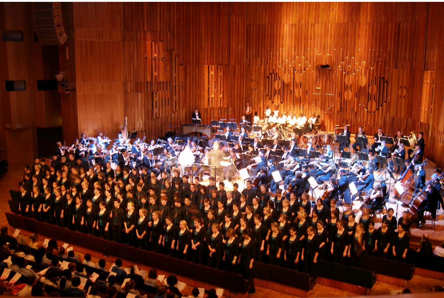
Prague Tour 2015