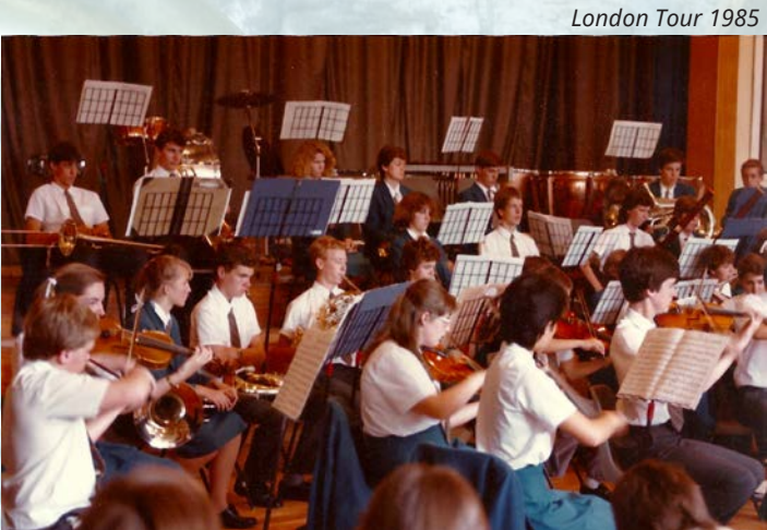
London Tour 1985