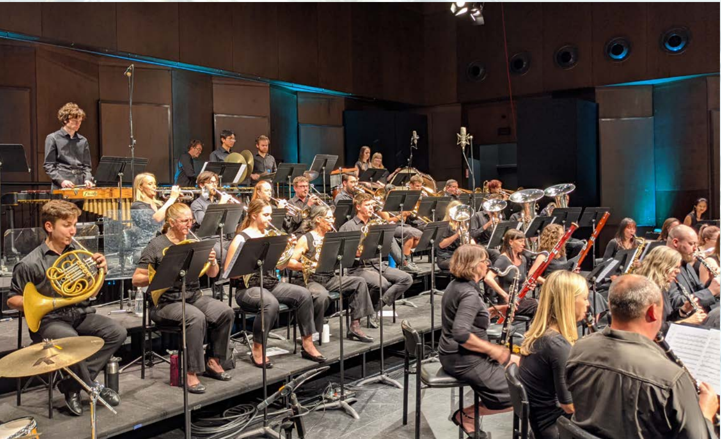
Alumni Band recording session