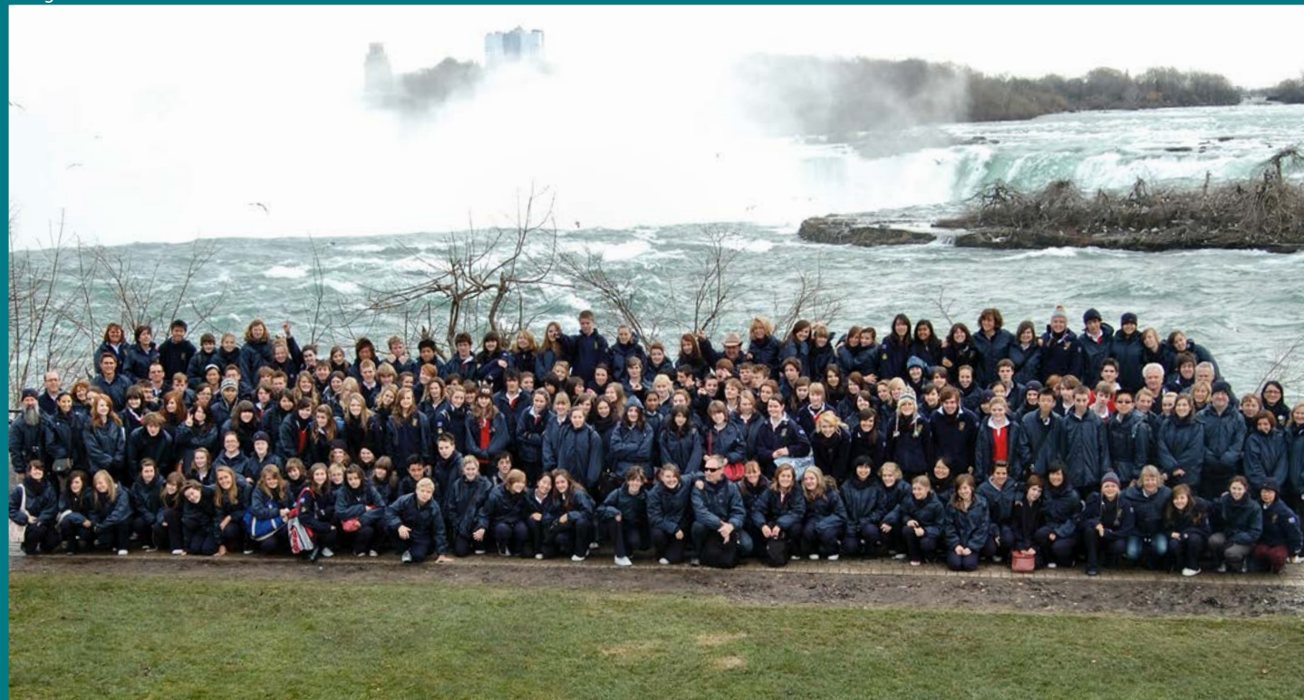
Niagra Falls 2009