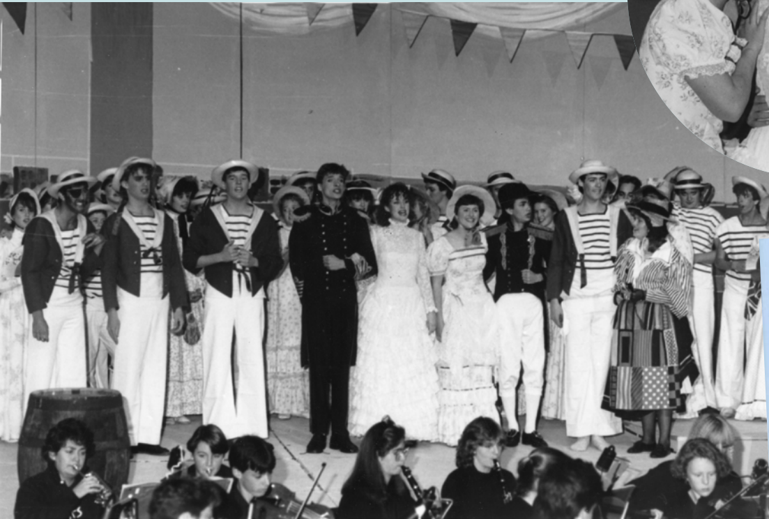
Musical Chorus 1986