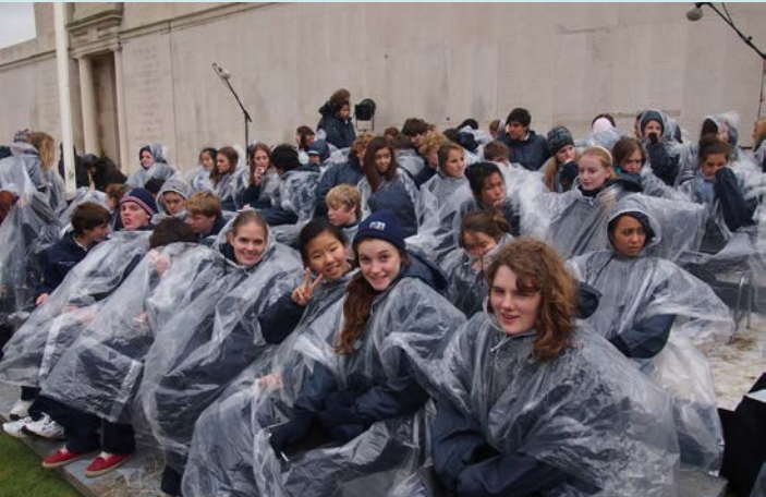
50 years of shared experiences