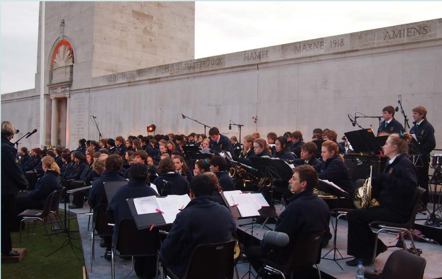
France Tour 2012