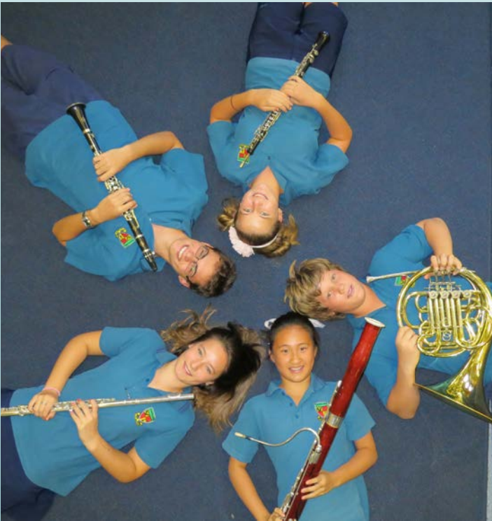
WW Quintet 2013