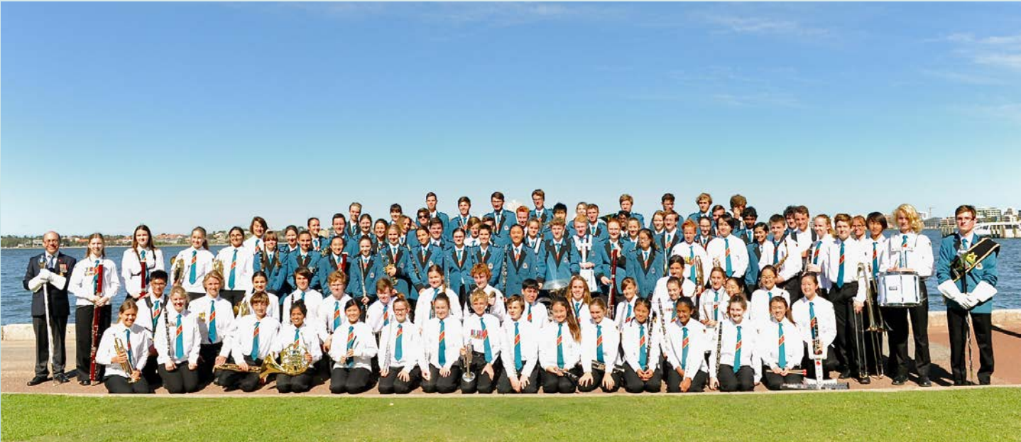
ANZAC Day Marching Band 2015