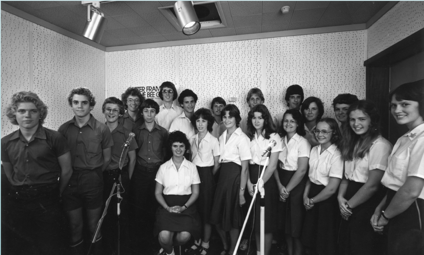
Chamber Choir in ABC Studios 1979