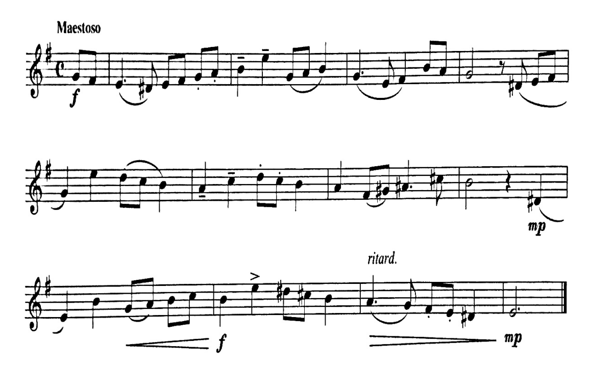
Brass sight reading, AMEB. 2004 Edition.