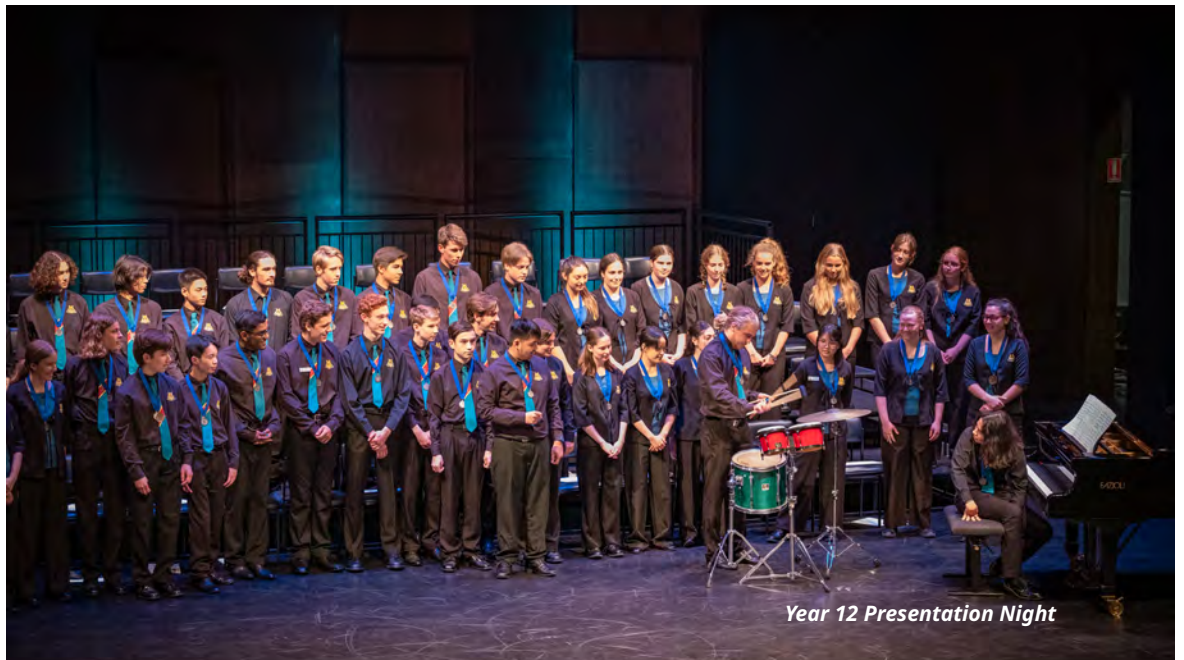
Year 12 Presentation Night