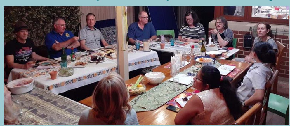
We like to make the MPC about having fun as well!

First-time Year 6 parent who will join the MPC in 2021