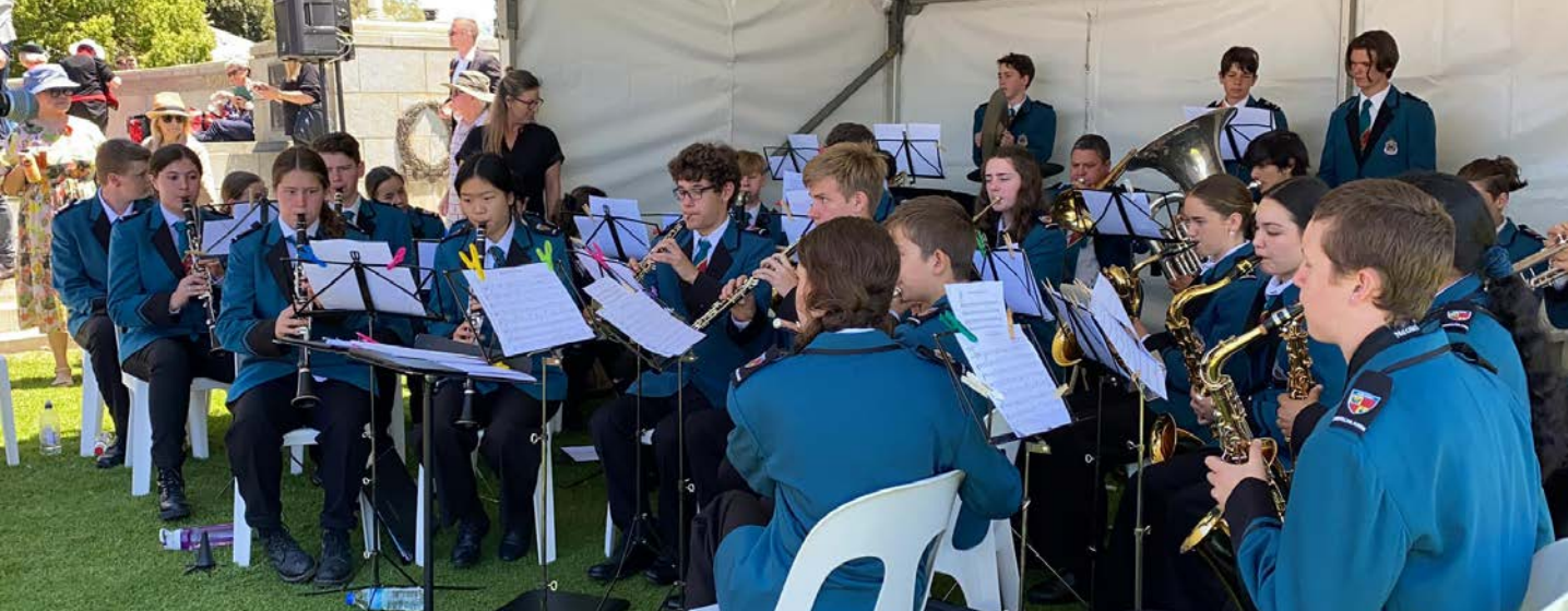
CSHS Memorial Band in action

The Churchlands Senior High School Memorial Band played for the Kings Park Remembrance Day Service on Nov 11. Their polished performance added to the spirit of this important anniversary.