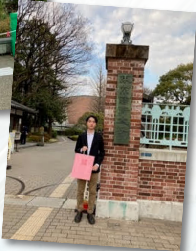
At front gate of campus