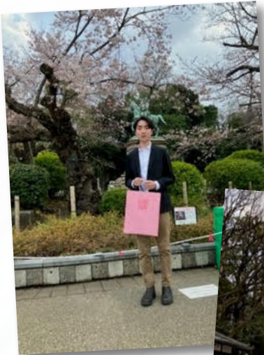
Cherry blossom season in Ueno Park