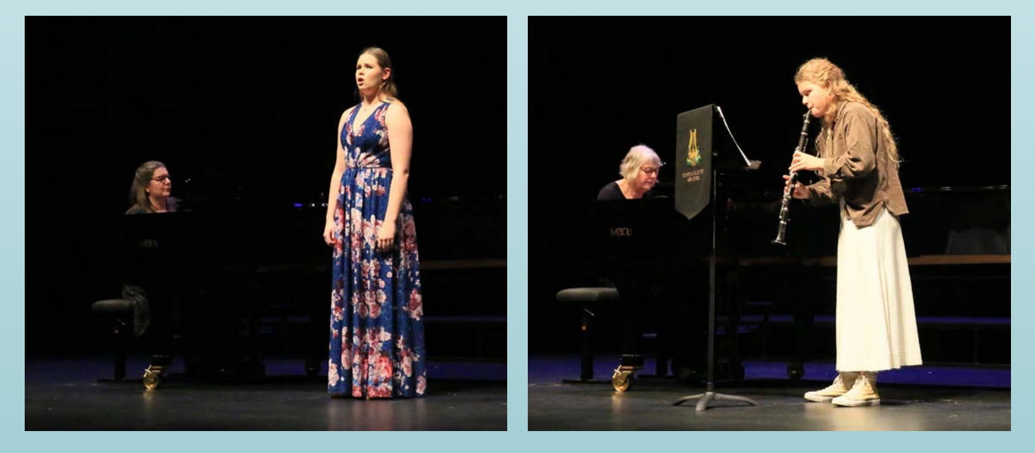
MusicNotes TERM 3 2022