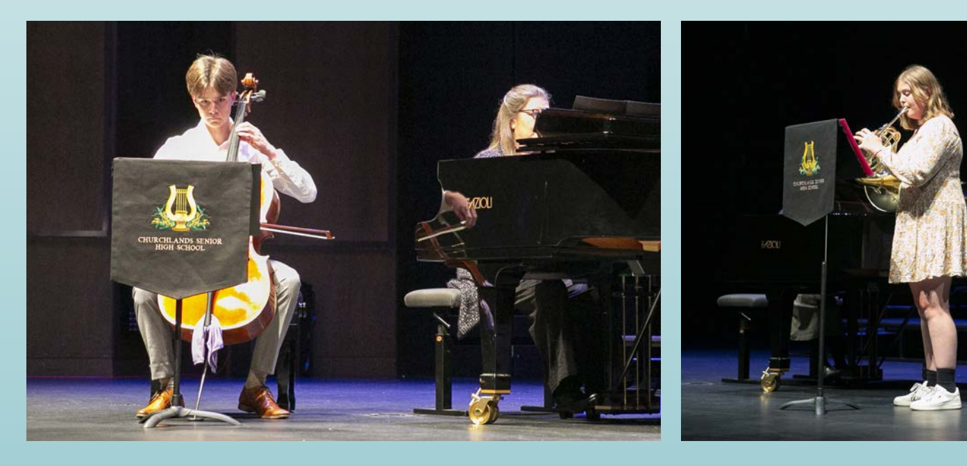
MusicNotes TERM 3 2022