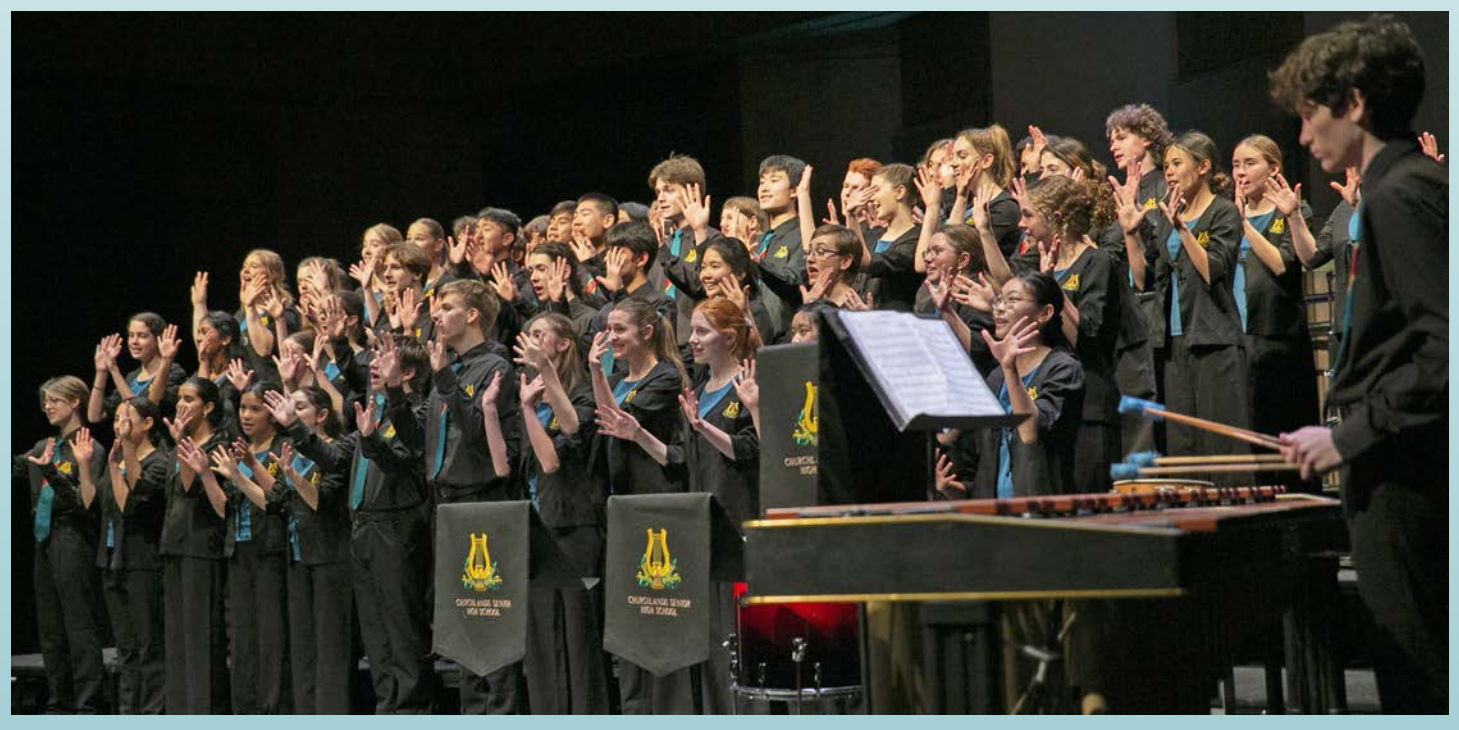
MusicNotes TERM 3 2022