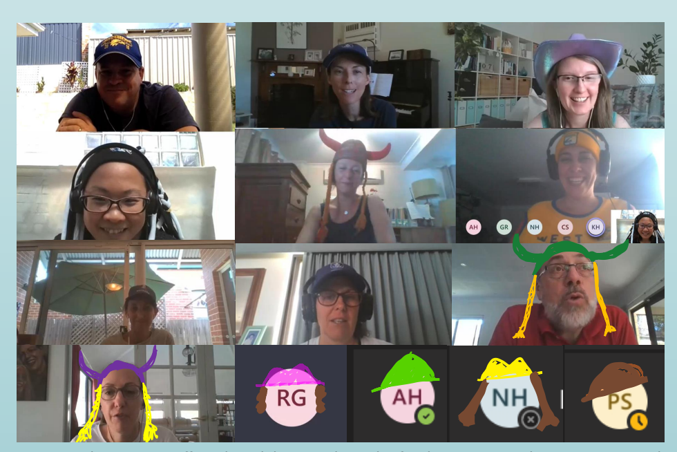
In week 10 music staff conducted their usual Tuesday faculty meeting on the Teams' app - with hats! Serious and thought-provoking topics were discussed in relation to the way forward next term. Music staff are always good at keeping their sense of humour in the face of adversity!