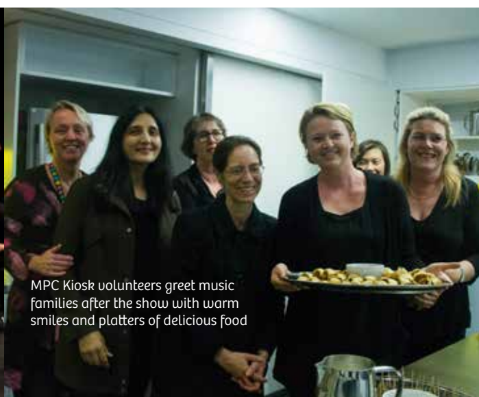
MPC Kiosk volunteers greet music families after the show with warm smiles and platters of delicious food