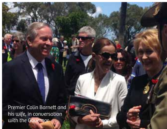
Premier Colin Barnett and his wife, in conversation with the Governor