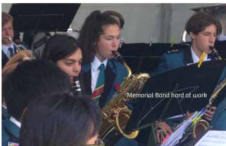
Memorial Band hard at work