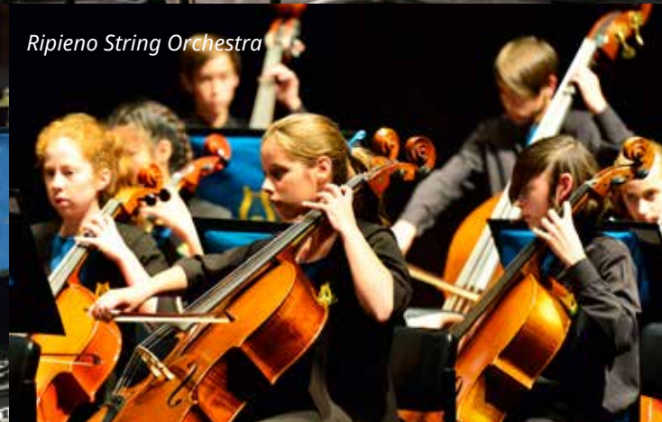
Ripieno String Orchestra