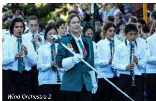
Wind Orchestra 2