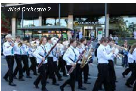
Wind Orchestra 2