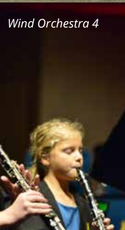
Wind Orchestra 4