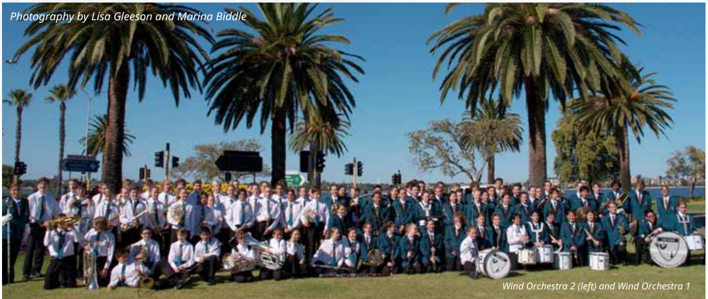
Wind Orchestra 2 (left) and Wind Orchestra 1