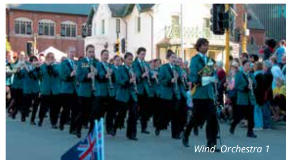
Wind Orchestra 1