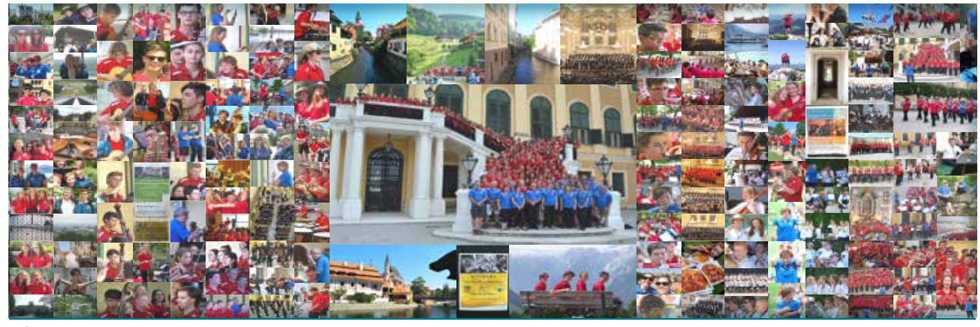
MusicNotes TERM 1 2018

Germany, Austria, and Hungary (Inc. Salzburg Choral 2018 1997 Festival) Hong Kong and China 2015 Germany, Austria, Hungary, the Czech Republic (Inc. 1994 United States of America (World Music Education Salzburg Choral Festival) Conference) 2012 Ireland, France and Belgium (Rep. of Ireland National 1991 England and Wales (Llangollen International Musical Titanic Centennial Commemorative Service, & Villers-Eisteddfod) Bretonneux Anzac Day Dawn Service) 1988 Singapore 2009 North America 1985 Switzerland, France and England Austria and the United Kingdom (Salzburg Choral Festival 1982 2006 Tasmania & Performance with the London Philharmonic Orchestra) 1978 Queensland and Victoria WA School's Concert Band to Vienna 2003 England and Wales (Performance with the London 1976 Philharmonic Orchestra)