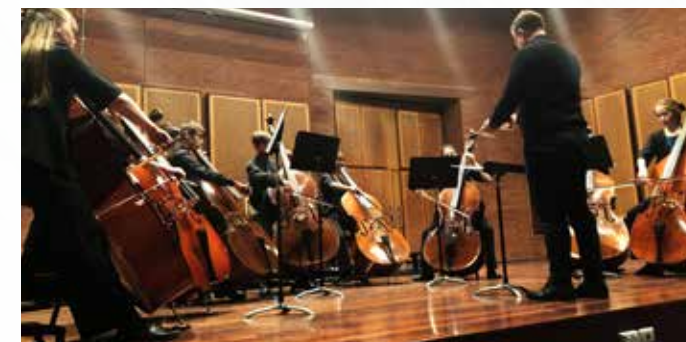
Above: Snapshots of some of the Chamber musicians Below: Group photo of all Chamber Ensemble Concert performers Photography: Neil Gomersall and Mirelle Hopwood