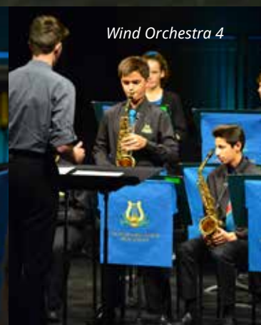
Wind Orchestra 4