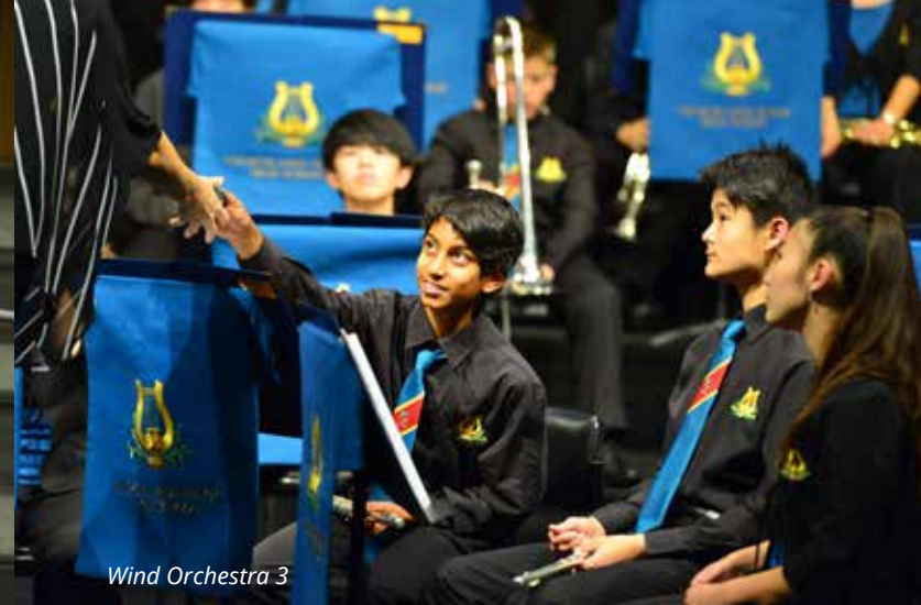
Wind Orchestra 3