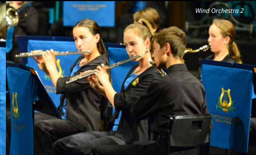
Wind Orchestra 2