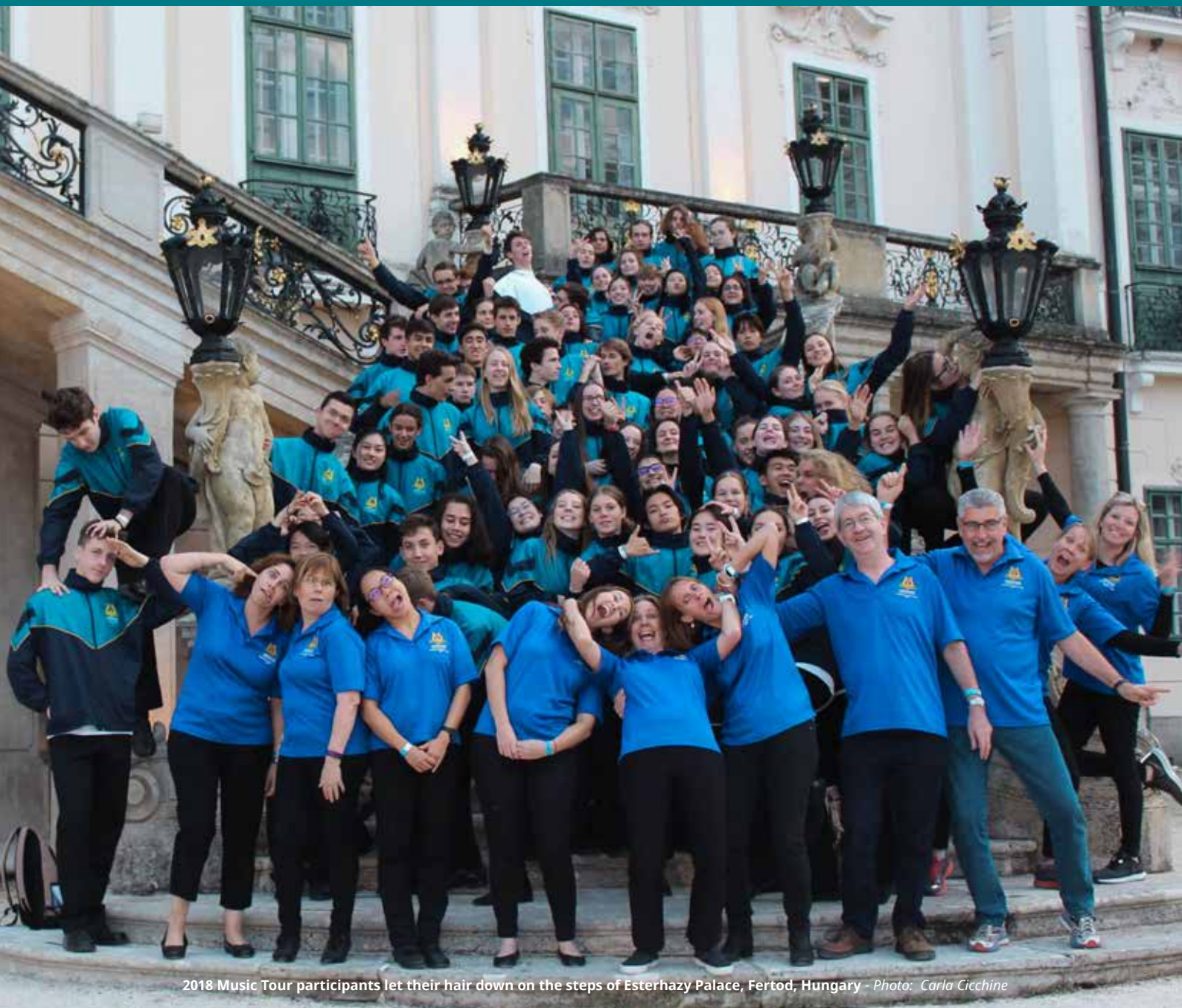
2018 Music Tour participants let their hair down on the steps of Esterhazy Palace, Fertod, Hungary