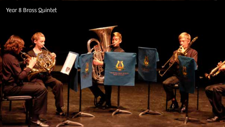
Year 8 Brass Quintet