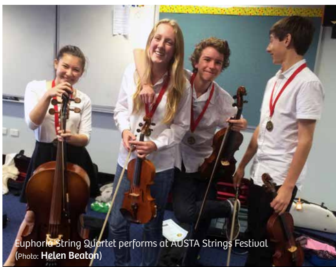
Euphoria String Quartet performs at AUSTA Strings Festival

Each year AUSTA (the 'Australian Strings Association') holds a festival, where string players from a wide range of abilities, get an opportunity to perform with a provided accompanist in front of an audience and adjudicators. Participants get awarded a grade and are given written feedback, with all participants receiving a medal. Our Year 10 String Quartet 'Euphoria' played beautifully at the AUSTA Day and was awarded the grade of Outstanding across the range of categories.