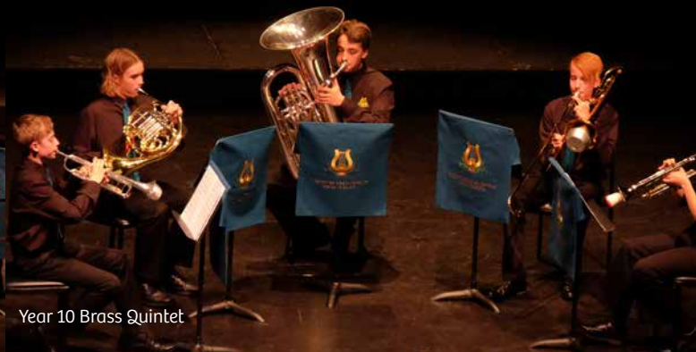
Year 10 Brass Quintet