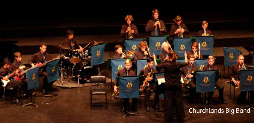
Churchlands Big Band