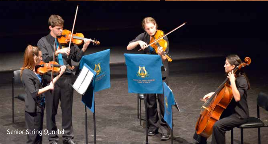
Senior String Quartet