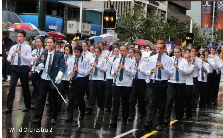
Wind Orchestra 2