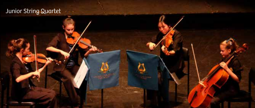
Junior String Quartet