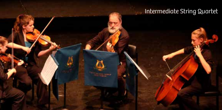
Intermediate String Quartet