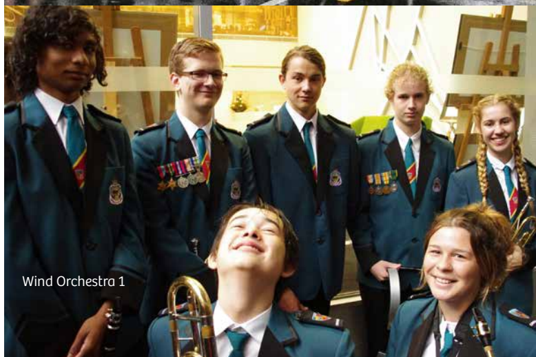
Wind Orchestra 1