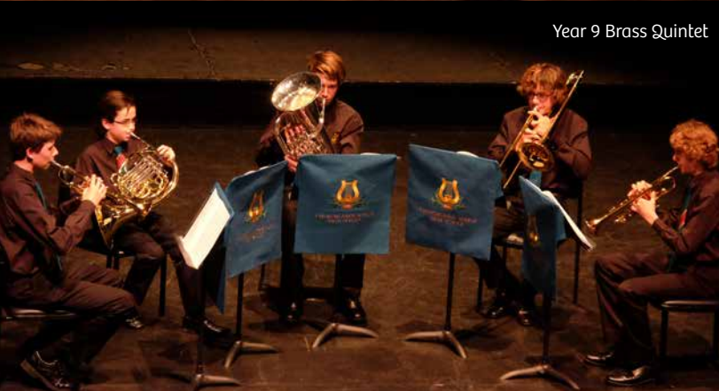
Year 9 Brass Quintet