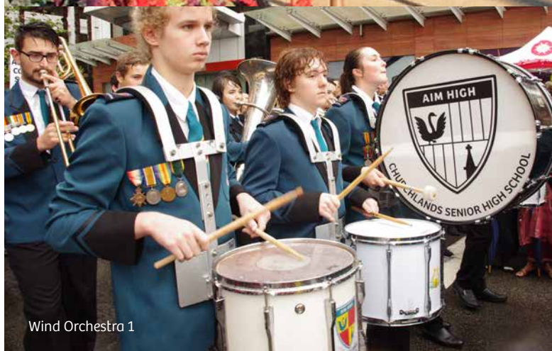
Wind Orchestra 1