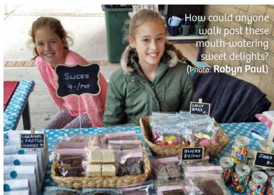
How could anyone walk past these mouth-watering sweet delights?

The MPC once again provided a selection of morning and afternoon tea delights at the recent Churchlands SHS Art Show. Over the course of the weekend we served lattes, cappuccinos and cups of tea, together with sensational slices, creative cupcakes and some extra little treats. Many thanks to Phil and Sue Blann for the use of their coffee machine, to Marina Biddle for her generous donation of 100 cupcakes, and the many others who provided slices and cookies for us to sell.