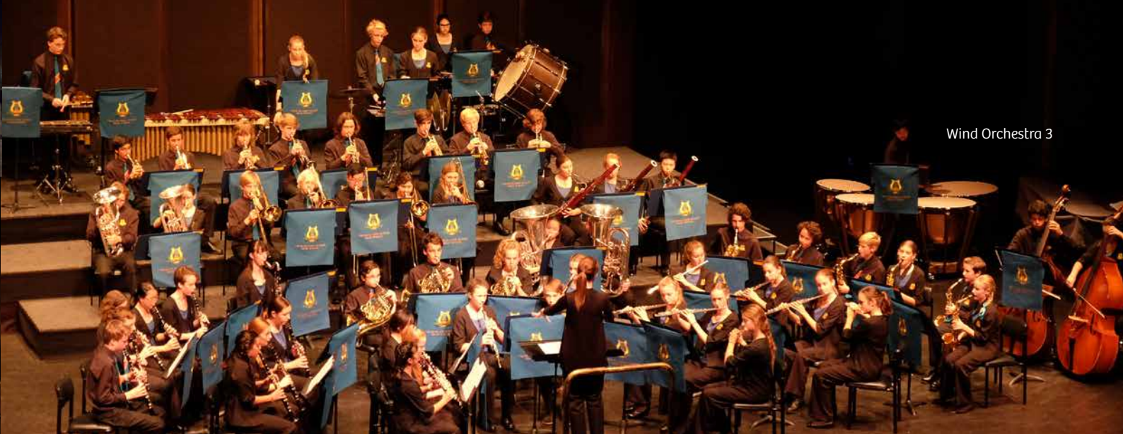
Wind Orchestra 3